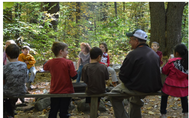
Enjoying time around the open fire.