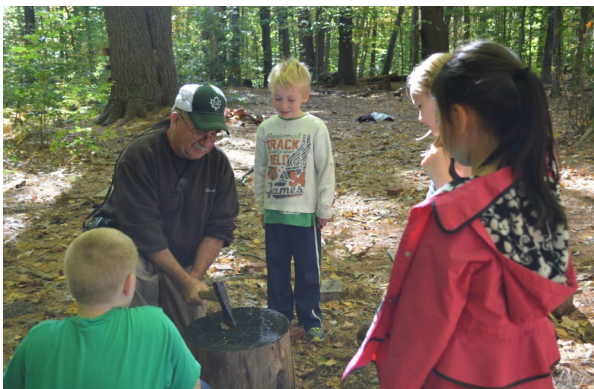
Another challenge....to cut a leaf exactly in half.