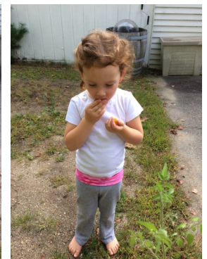
A Preschool friend picking the last of the tomatoes on a warm September morning.